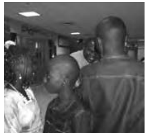
The reunion was unforgettable for all the members of the family.