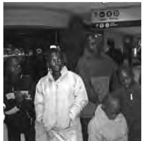
The happy Congolese family at the Calgary Airport