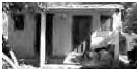
One of the houses built

The Society has now granted $28,000 to this country, with 10% of the project budget being raised locally by the Society.