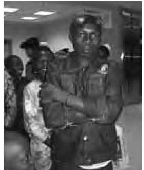
Our Congolese Vincentian friend at the Calgary airport