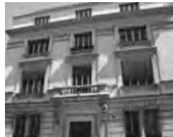
The Society's headquarters in Paris

According to the International Rule, « the mission of the International Executive Committee is to coordinate the Society's international strategy » in between the meetings of the General Assembly. It is also intended to « help and advise » the President General in the choice of strategic directions to be taken. It also acts as the General Assembly of the Confederation, outside the plenary meetings which take place every six years.