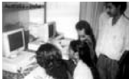
Twinning India - Australia

members, must call themselves mother-conferences, and [...] dispatch their members to conferences that need them." (Excerpt from the Minutes of the Particular Council of January 30, 1844) Twinning is therefore an old concept born out of the spirituality of the Society, based on exchange, solidarity and sharing. Through all of the Society's history, this mutual assistance was always encouraged by the various Presidents General.