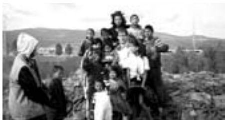
Twinning France - Romania

As defined by the Rule of the Society that in part reads ... "The awareness of acute poverty in a great number of countries and the Vincentian preferential option for the poor spur Councils and Conferences to assist others with less resources." The activity between two Conferences, Councils, a fundamental activity of the Society, is the expression of Vincentian fraternity and solidarity. In many parts of the world, Councils and Conferences do not have sufficient resources to alleviate suffering. Twinning is a 'special work' of the Society. It takes place when Councils and Conferences in more affluent countries reach out to help their Vincentian Brothers and Sisters in less affluent countries with their work. The three basic elements of Twinning are prayer, correspondence and financial/material assistance. Assistance can be interpreted broadly and may, for example, include technical experience in a specific field.