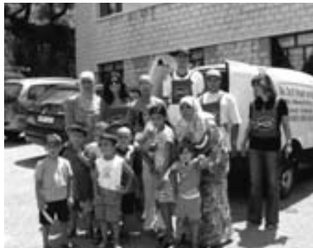
Lebanese kids with their mothers are posing with the volunteers of the SSVP

The needs were enormous and the resources limited. But God never abandons his children. From the very first day of the war, Vincentians were present in all the refugee centres to help these people.