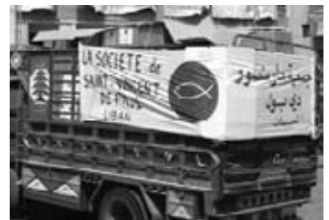
A truck of help ready to leave for Southern Lebanon

At the end of September, more than 5500 food parcels, 500 portions of bread, fruit and vegetables, together with cake, had been distributed, as well as nappies and other items for 300 babies, 700 packages of toiletries, 3500 packs of medication, first aid products, sheets and towels, clothing and underwear, etc., with a total value of 426,090,000 L.L., around 230,000 euros.