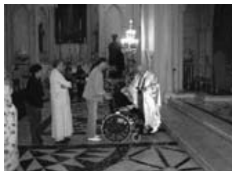
The Society helps Christians attending Mass, and has fundraising events during it.

The Society of Saint Vincent de Paul in Jerusalem, the cradle of Christianity, is one of the oldest in the world, founded in 1851. For 155 years, the Conference of the Holy Sepulchre has been serving the poor of the community in the Holy Land, where the Christian population forms less than 2% of the region's population, and has serious problems (unemployment, poverty, etc.). The Society is initiating several programmes on their behalf over the next five years.