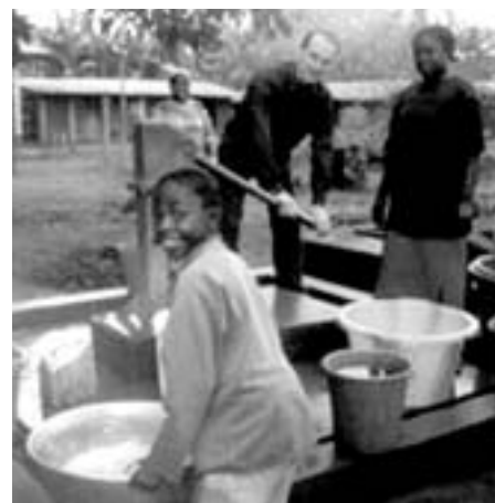
Twinning France - Cameroun

Soon an International Twinning Manual will be available at the Council General.