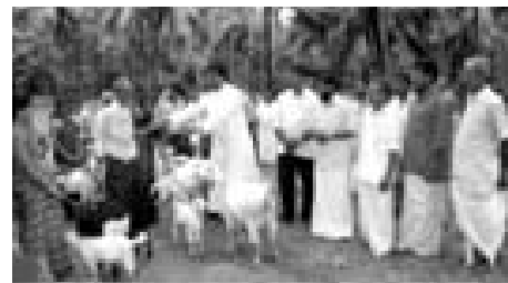
Goat distribution in Irinjalakuda

The idea works especially well in India, with very good results, through animal raising projects that provide employment and livelihood to a lot of needy families, and that also supply milk and milk products to community dairy farms and manure for farming.