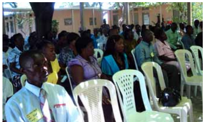
170 participants to the second Sunday mass