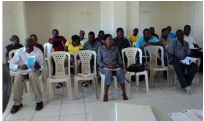
Training in French to 24 trainers (first week)

Jean-Noël Cormier, President National Council of Canada